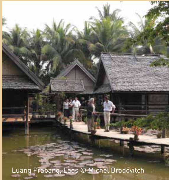
Luang Prabang, Laos

Simultaneously, an essential work tool, the Plan for preservation and promotion (PSMV), was developed. It is made up of a regulatory part and an advisory part. It defines the modalities for managing the site: village-contracts that enable urban development, the setting up of an intervention