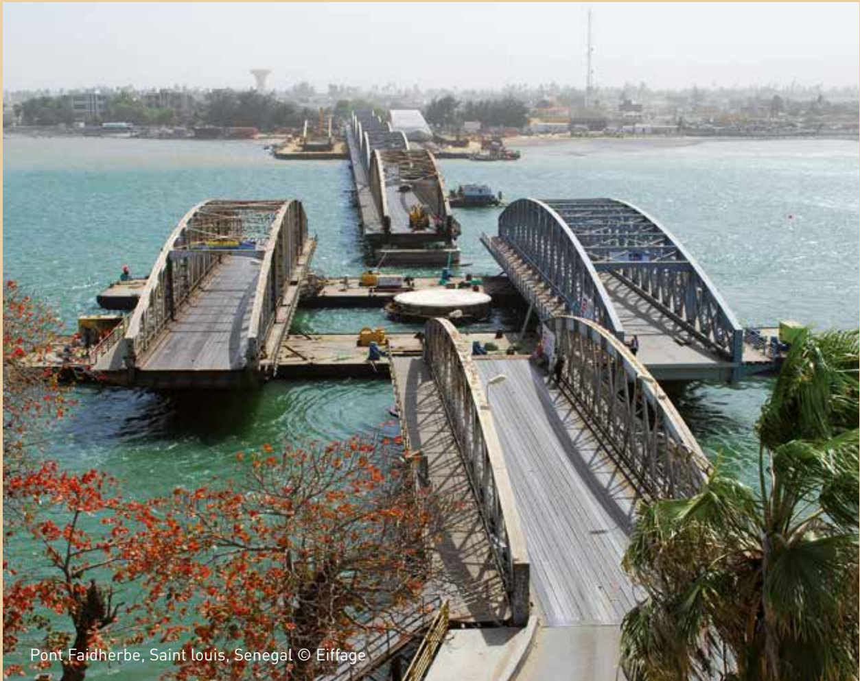
Pont Faidherbe, Saint Louis, Senegal