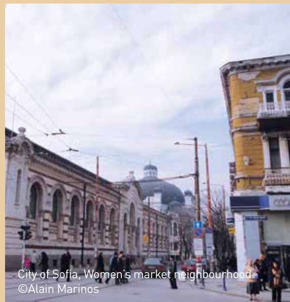
City of Sofia, Women's market neighbourhood

As a continuation of this approach, and with the support of architects and experts from the Ministry for Culture and Communication, the cooperation between the cities of Sofia and Paris goes on. A project in the historic quarter of the Women's Market that draws inspiration from the plan to preserve and promote the Marais neighbourhood in Paris is under consideration. A partnership agreement was signed in June 2015 between the mayor of Sofia, the mayor of the district in question, the mayor of Paris' 3rd arrondissement and Yves Dauge, former senator for the Indre-et-Loire department.