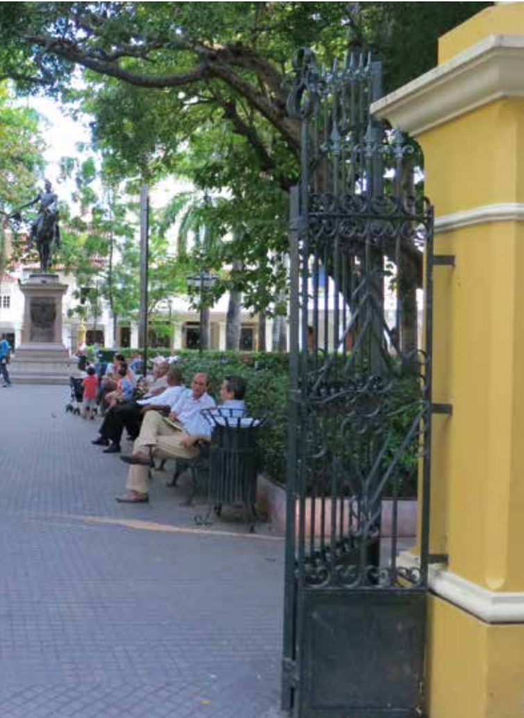
By creating the indispensable link between the inhabitants and their living environment, the cultural

dimension can give a sense to the urban project and renew the links with the layers of a city's history, whilst also looking to the future. By combining a heritage approach and modern-day construction of the city, urban development avoid falling into the trap of caricaturing tradition. The city that respects its heritage and cultural specificities is a space for freedom and exchanges and can become a laboratory for the urban innovations of the future.