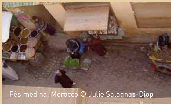
Fès medina, Morocco

Another remarkable action has led to the creation of six tourism circuits that now integrate handicrafts, thus fostering the job creation and income-generating activities. Passing by 2,200 sales points, these circuits also aim to strengthen the commercial capacities and increase the incomes of more than 10,000 self-employed craftsmen or craftswomen. Going further, these circuits will also benefit the hotel, catering and tourist guides sectors. Centred on quality crafts and culture in the broader sense, these circuits will increase the flow of tourists to the major heritage sites. The project has endowed the medina with appropriate signage for tourism: 308 signposts for directions, information and interpretation. Some of the posts are equipped with a digital code that can be read by smartphones, enabling the visitor to locate themselves and obtain more information on the location, the history of the occupations they will encounter on their trip and on the city.