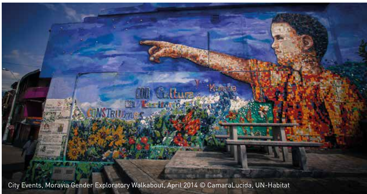
City Events, Moravia Gender Exploratory Walkabout, April 2014

The challenges relating to culture and heritage relate to the very way of conceiving city, as a place for exchange and creation, and respect for the diversity of countries' urban cultures. A city that is sustainable affirms the principle of territorial unity, refuses borders and segmentation. Everything that is culture is, by definition, by necessity, the complete and deep irrigation of territories. It is necessary that these affirmations be translated into legislation and regulation, but also into commitments towards a development that is balanced and mitigates the excessive concentrations and the abandonment of the traditional fabric of rural life and small and medium-sized towns where social and cultural bonds have long existed and are precious goods to be preserved. The same applies to the numerous historic centres and neighbourhoods of our cities that are places of heritage, of creation, of memory that are in danger and all too often ignored.