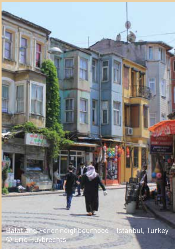
Balat and Fener neighbourhood – Istanbul, Turkey