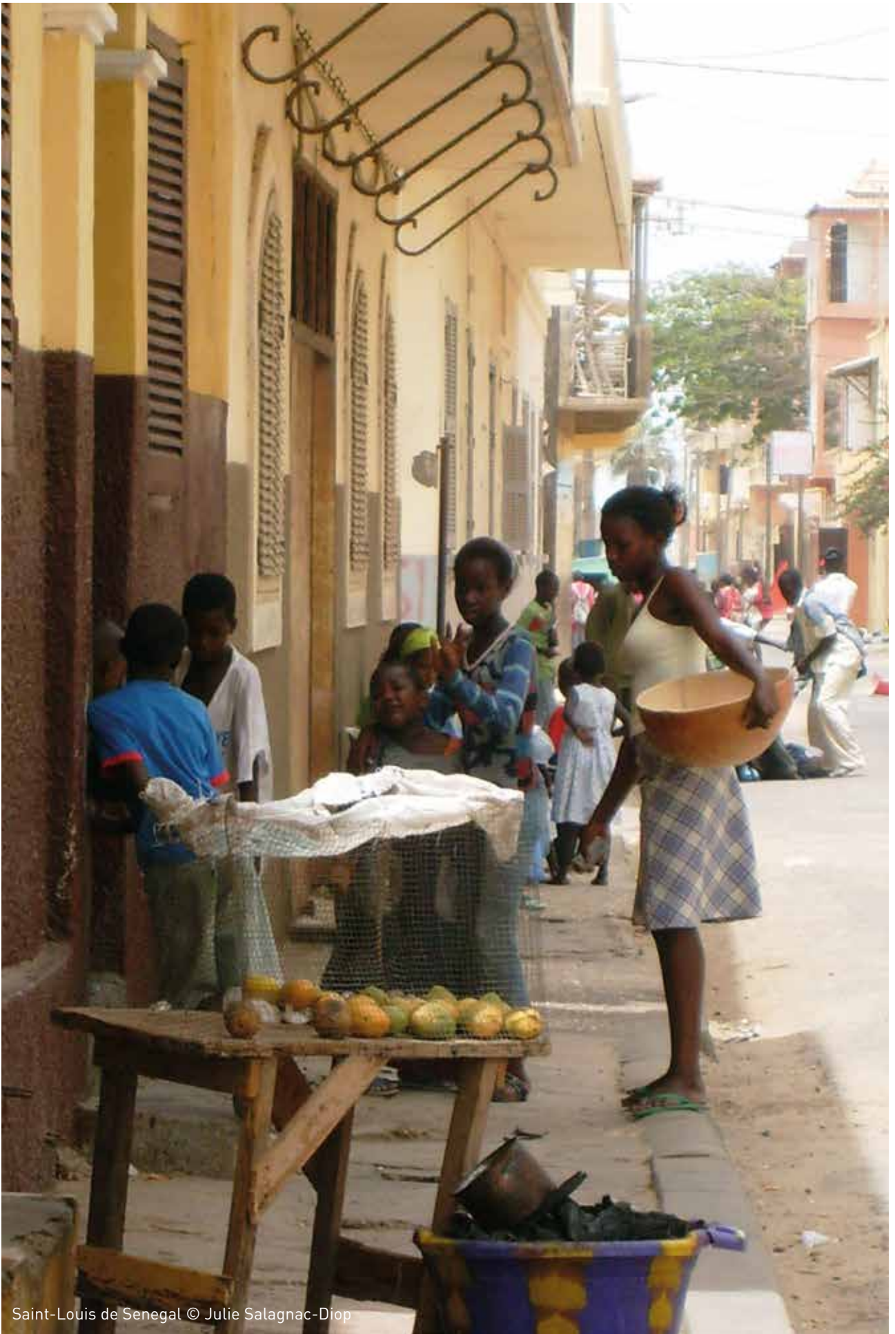
Saint-Louis de Senegal