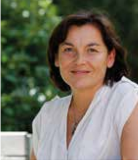
Annick Girardin Minister of State for Development and Francophony, attached to the Minister of Foreign Affairs and International Development

The world is becoming ever more urbanised. Cities are growing, spreading and multiplying at an unprecedented rate. Their rapid evolution is accompanied by deep environmental, economic and socio-cultural changes.