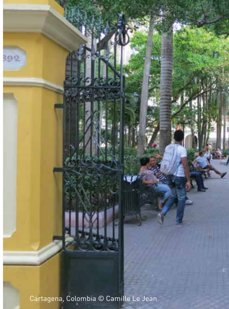
Cartagena, Colombia

In this context, new challenges are emerging, in which the priorities are to give a sense to our living environment, the goal being to create attractive, living, inclusive cities, in which social diversity and cultural and citizenship values are better taken into account. This need is particularly strongly felt in our contemporary societies that are characterised by the diversification and interpenetration of cultures, notably as a result of globalisation and migratory flows. Conceiving urban projects through the prism of culture enables solutions to be found to those issues in terms of symbolic renewal and right to the city. Heritage and cultural dimensions must be at the heart of all urban projects, because they are the conditions for a true perception of issues at stake in an integrated and sustainable ap-